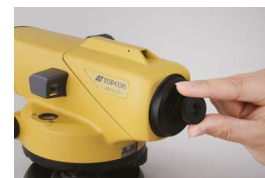
40x Eyepiece EL5 (AT-B2)