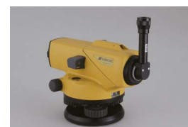
Diagonal Eyepiece DE16 (AT-B2)