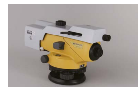
Optical Micrometer OM5 (AT-B2)